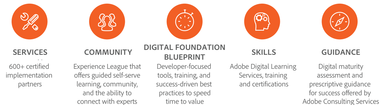
Figure 4. Experience Manager resources and ecosystem to guide you through your business, organization and technology needs

Finally, the area of omnichannel customer experiences is dynamic, exciting, and challenging. Beyond an adaptable architecture and approach, we have also invested in a set of additional resources to help with your organization's omnichannel efforts. Start with your business needs and strategy, and reach out to Adobe and its ecosystem of partners for guidance and an approach that will fit your needs today and well into the future.