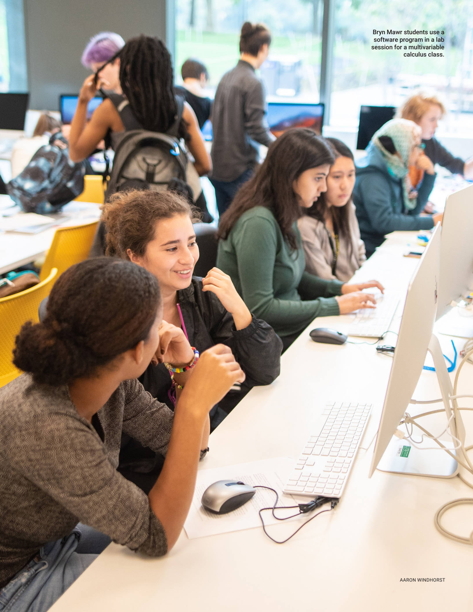
Bryn Mawr students use a software program in a lab session for a multivariable calculus class.